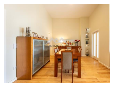
= 3 Bedrooms