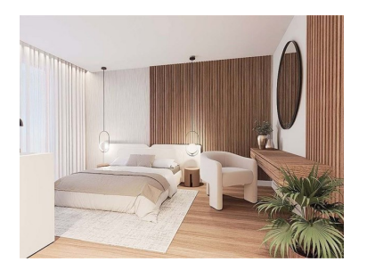
= 3 Bedrooms